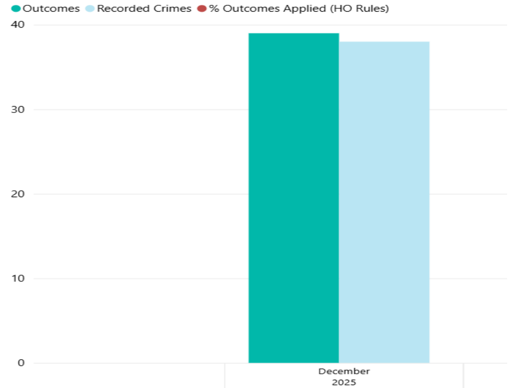
Outcomes, Recorded Crimes, % Outcomes Applied (HO Rules) over Time